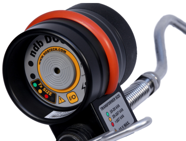
NDB-DOC™ easy to use interface