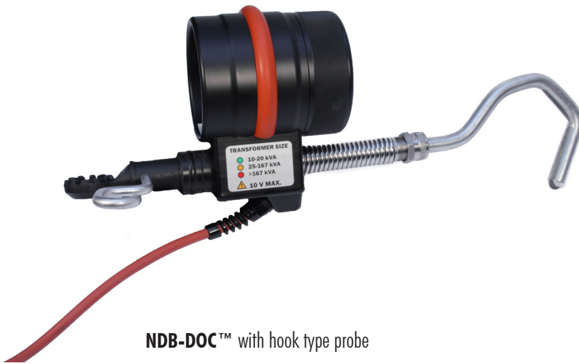
NDB-DOC™ with hook type probe